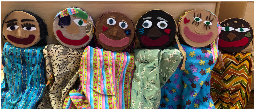
St. Lucy, St. Louis, St. Valerie, St. Rainbow, St. Allie, and St. Sarah

We pray for ourselves, that we will be faithful, compassionate, and open to God's love and leading, and to all whom we encounter through these tension-filled times. Across whatever division or disagreement, may our words and deeds seek to honor the humanity and God-given dignity of every human being.