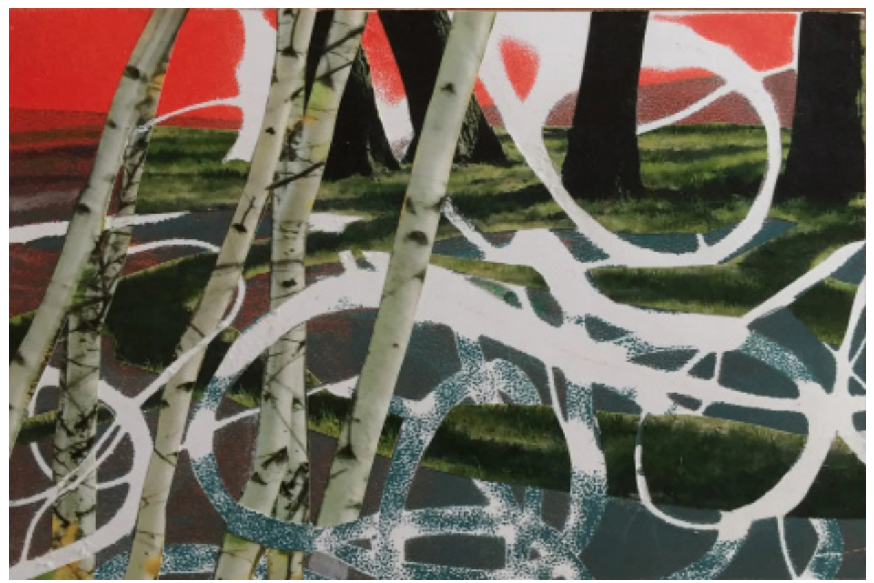
O sing to God a new song; sing to God, all the earth. Let the field exult, and everything in it. Then shall all the trees of the forest sing for you.