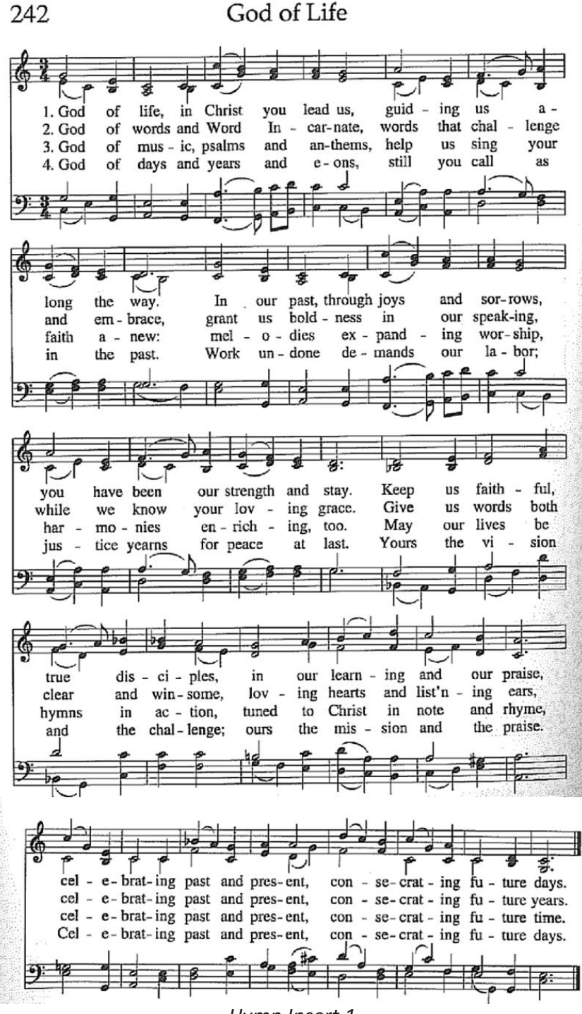
-Hymn Insert 1-