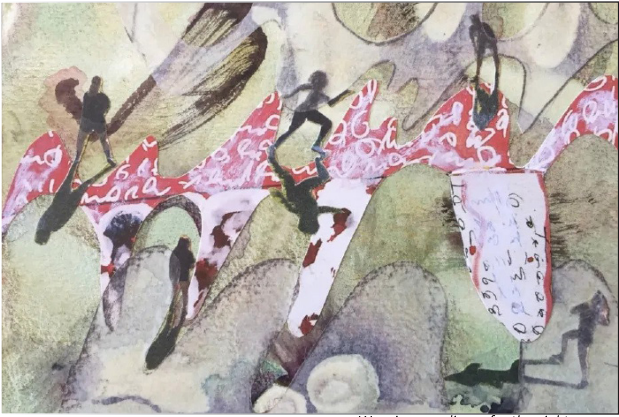
Weeping may linger for the night, but joy comes with the morning. Psalm 30:5